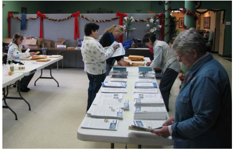
Mail brigade in action.

April 19-25 is National Volunteer Appreciation Week. This year's theme is "Celebrating People in Action." We, at Hope Gospel Mission, want to take this opportunity to thank the many volunteers that come our way. We celebrate you! You make it possible to provide life changing opportunities for the people who come to our doors for help. You are people who care, who want to give; you are our neighbors and friends who inspire others by your example. It is only through the dedication and hard work of our many volunteers that we can continue to provide the level of services that we do. THANK YOU!