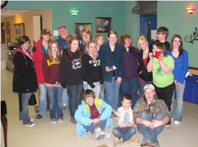
A youth group cooked for the phase promotion.

FILL THE FRIDGE was sponsored by Gateway Chiropractic from March 9th to April 4th. The event concluded at Festival Foods on April 4 th . Special thanks to Gateway Chiropractic, Festival Foods, Lebakken's (who provided the fridge), and the many people who contributed food. Fill the Fridge provided much needed fresh foods and meats for the residents of HGM's shelters. We thank all who took part in making this event a success.