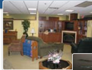
▲ Living Room

The Ruth House is a safe haven for single adult women who are going through very difficult life experiences. It officially opened in November of 2005 and has been helping women in western Wisconsin for more than five years. The purpose of the Ruth House is to meet the basic needs of the women residents, prepare them for successful independent living, and foster spiritual growth through sharing the gospel. Each resident's stay will vary according to individual needs.