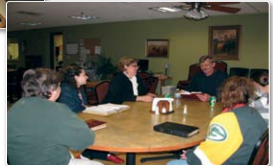
▲ Weekly Bible study

Women come to the Ruth House with a variety of needs and issues and each person receives personalized attention and services. Some women just need emergency help and may stay for one to seven days. Others may need short term help, due to the loss of a job or housing, until they can get back on their feet. But many women come to us with serious addictions, broken relationships, mental health issues, large debt, unemployment, and related issues that have resulted in them being homeless.