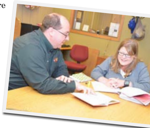
SLC staff & volunteers work one on one with the residents & students from the community.