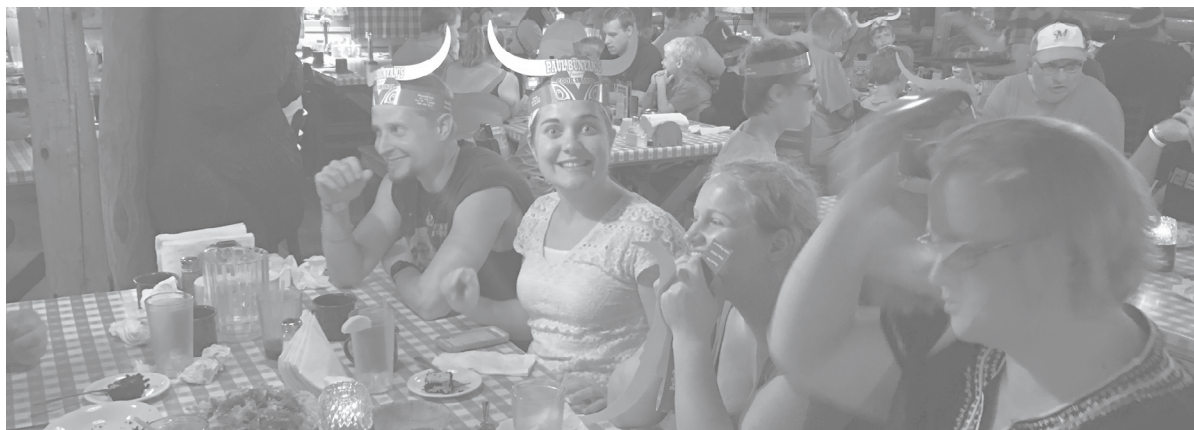
Residents and staff enjoying an outing to Wisconsin Dells.