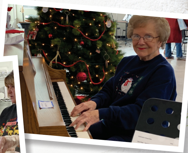
Annual Christmas Community Dinner Saturday, December 18, 2021 | 11:30 am-1:30 pm

Gifts given in honor of or in memory of loved ones can be viewed online at HopeGospelMission.org .