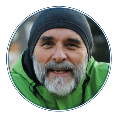
"I'm just thankful for being here. I'm in a safe place, and I thank God for that. I'm moving toward my goal, which is to become a new person."